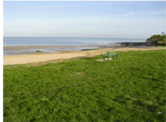
La plage de la cible

Comfortable family house with 2 verandas and closed garden with fruit trees. A short walk from the beach and tidepool area, and from the picturesque harbor town of St Martin on the Ile de Ré. The house has a spacious living room dining room with fireplace, an open kitchen, a bathroom, wc and entry hall. TV, Hi Fi stereo system, barbecue, and all cooking utensils. For additional information, visit: http://www.3colorz.com/romarine/ .