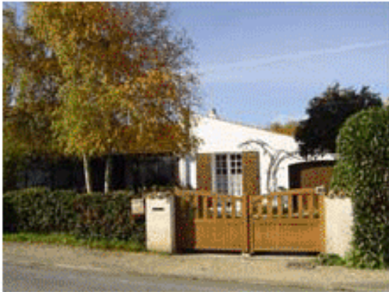
La Romarine, entrée jardin est